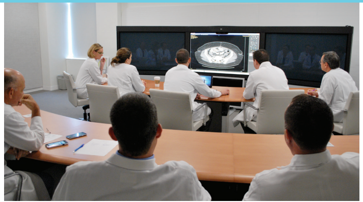
Liver Tumor Clinic Multidisciplinary Team